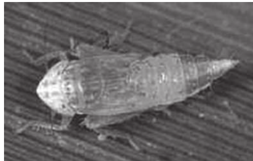
Magnification \times 10

Plan an investigation to determine the effectiveness of wolf spiders, bred in the laboratory, in the control of leafhopper nymphs in rice fields.