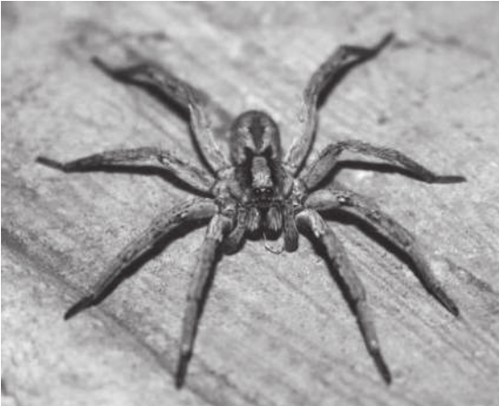
Magnification \times 1