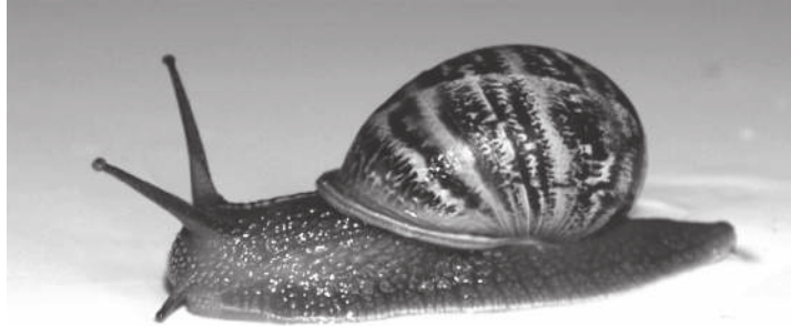
A Snail – Magnification \times 2

After repeated exposure to the same stimulus, the snail will stop responding to the stimulus. This behaviour is called habituation.